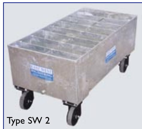
Type SW 2