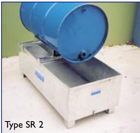
Type SR 2