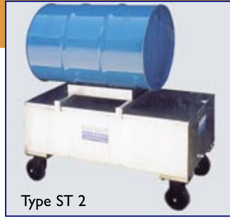
Type ST 2